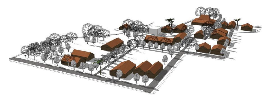
Figure 2. Ilustration of dwellings in Ngibikan Village RT (neighborhood sector) 05 before the earthquake (Drew by Destaza H-2008)

Phisically, this settlement has common characters of village dwelling, it could be seen from the borders of river, cemetery and rice fields. Besides that, the character of housings is very simple visually, with irregular layout pattern. See Figure 2.