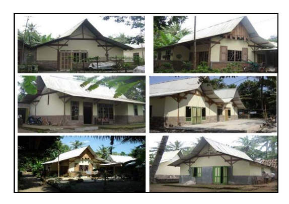
Figure 4. Houses condition in Ngibikan Village RT (neighborhood sector) 05 after the earthquake

• Structure and construction of the houses is earthquake resistant. See figure 4.