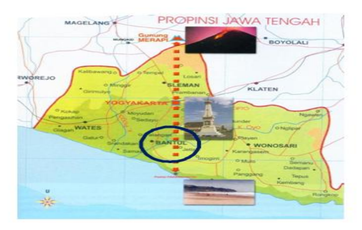
Figure 1. Map of Bantul, Special District Yogyakarta

This research had been conducted in the area affected by the earthquake: dwellings in RT 05/neighborhood sector (there are 6 neighborhood sectors) Ngibikan Village, located in Bantul Village, approximately 15 km from Yogyakarta, Indonesia. See figure 1.