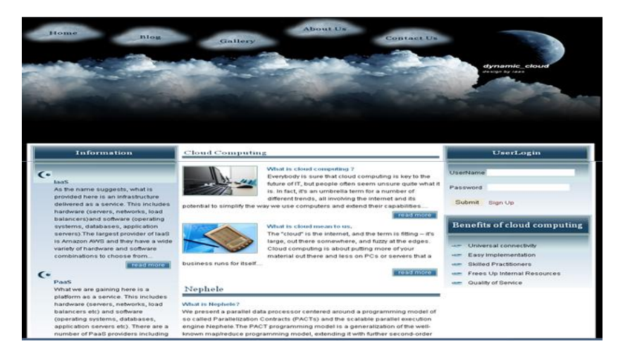
Fig:1.3 Home page of cloud

Before client creation we check the user credentals by login page, we receive the username and password by the user and we will check in the database, that the user has the credential or not to give request to the cloud. If the client wants to register we can add new user through user registration by taking all the important details like user's name, gender, username, password, address, email id, phone no from the user