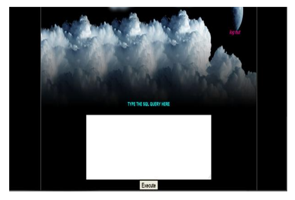
Fig: 1.5 SQL Page of cloud.

To receive the sql type of request, user can put any type of sql request here by clicking on the execute button. The request is sent to the appropriate sql server on the cloud and the result will be posted back to the client machine